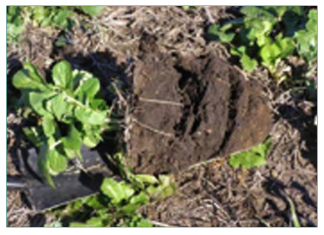
Infiltration barriers.

sive amount of high-carbon crop residue on their fields. Their main resource concern is finding a way to break down this crop residue. Additionally, the Bauers still have a noticeable plow layer in their soil from tillage in previous years. This layer inhibits water infiltration and root growth. The Bauers would like to use cover crops to improve the soil quality of their crop land.