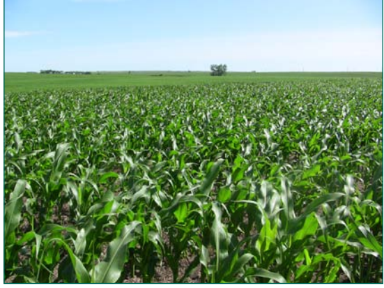
Corn crop after CRP.

When income and expenses are considered together, the Bauers ended up $796 ahead at the end of 2008. In addition, they were able to make this conversion to cropland in only one and a half crop years, compared with the three years it usually takes to fully decompose CRP residue prior to successful cropping. In addition, the Bauers were very pleased to have not used any tillage in the conversion process. This allowed them to conserve the beneficial soil structure provided by the 20 years in CRP.