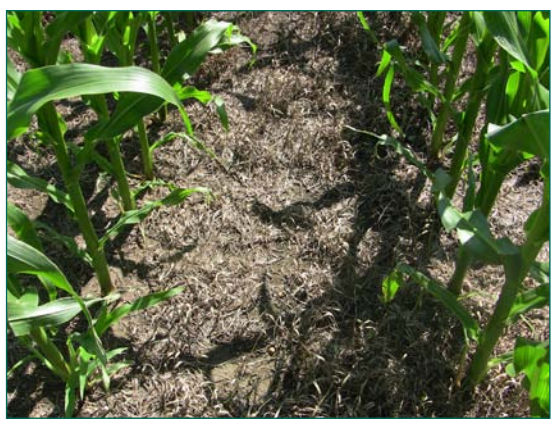
Residue in corn field.

The Bauers allowed the cover crop to winterkill and planted corn in the spring of 2009. The corn was harvested for grain in the fall, with a yield of 80 bushels per acre. While this is 20% less than the county average of 100 bushels per acre, Glenn was happy with the crop, as it yielded only slightly less than his other dryland corn fields that year. In 2012, the field was in full crop production and it now yields similarly to the Bauers' other acreage.