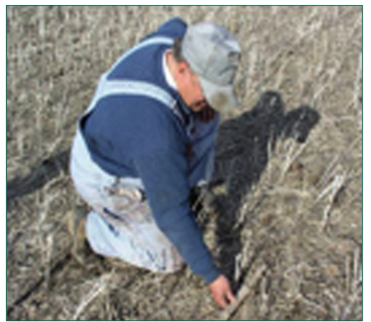
Three years of crop residue: corn, wheat, and canola.

Unlike other farmers in the area, the Bauers do not have livestock. Their operation is devoted to crop production. As a result, their resource needs are different from other no-till farmers who have livestock. Specifically, the Bauers have an exces-