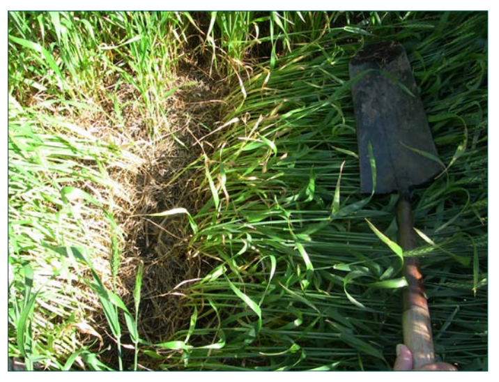
Wheat residue without prior cover crop.

Glenn is also experimenting with a longer, fullseason cover crop cocktail prior to a wheat crop. He believes that growing a cover crop for a full season may provide more benefit to a subsequent wheat crop than a short-season cover crop would. In late May of 2012, he planted a cover crop cocktail on a section of land (640 acres) with a mixture of turnip, radish, buckwheat, barley, and sweet clover. He divided the section into 10 paddocks and turned in 70 head of cattle in the last