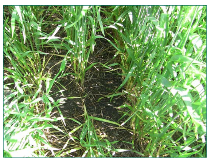
Wheat residue with prior cover crop.

part of July. The cattle rotated through the paddocks until the end of September, receiving two months of forage from the cover crop. A portion of this section had no cover crop or grazing, so that Glenn could make comparisons between the treatments. Next year (2013), Glenn will plant a crop of wheat on the section to see if there are any differences in wheat response after this treatment.